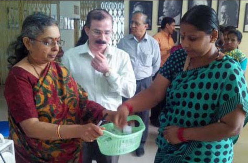
School admission under R.T.E quota selected by lottery system held on March 3.