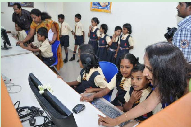
Bhavan-BBMP Public School students are busy with their new computer donated by Canara Bank