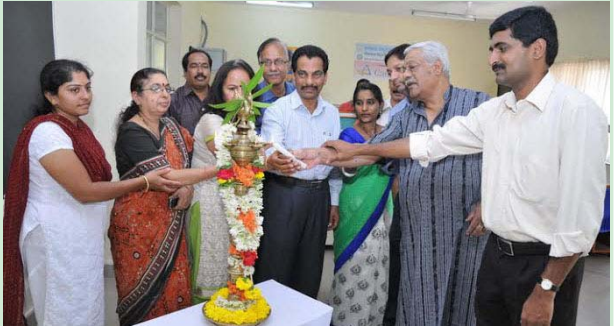
Dignitaries lighting the lamp