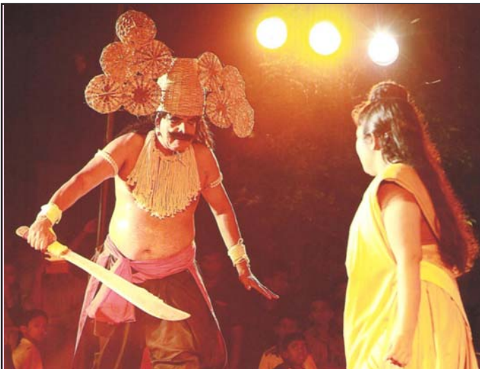
Seetha Kali by Vijayasree Arts Club held on August 8th at Kollam.

28/08/2017- Seetha Kali a dance feature was presented by Vijayasree Arts Club. Seetha kali is an indigenous and ethnic art form of dance in kollam with a century old heritage. Perinad in kollam was also one of the places of origin of seetha kali among other backward class areas in kollam. Later in Perinad Seetha Kali became popularized as a festival promoted form of art irrespective of caste, creed and sex. And Seetha kali became an art form of perinad. During the past decades Seetha kali was organized from Atham till the day of thiruvanam in every Onam.