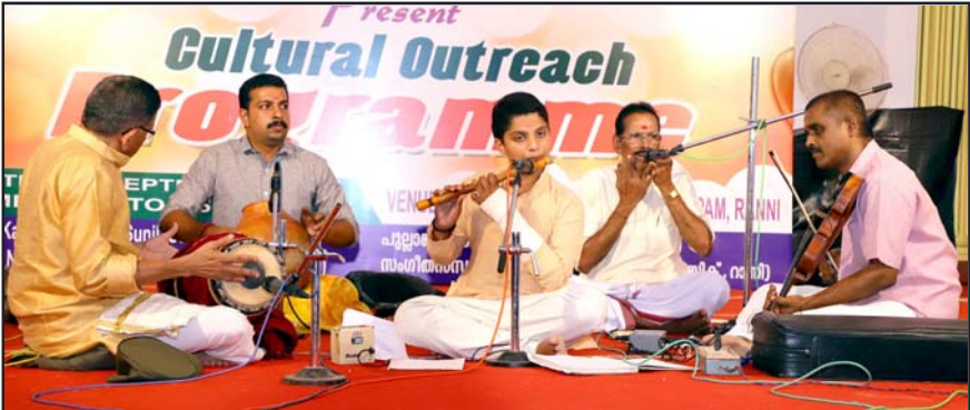
Flute kacheri by students of Asha Bharathi school of music held on September 24th at Ranni