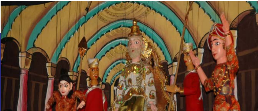
Rod puppets in action at puppet festival

“Once again, I thank the organization for inviting me to this puppet display,” she concluded. ●