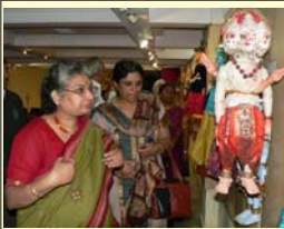
Puppet show Page -6

This hefty award is instituted by Karnataka's own proud cine artiste Dr. B. Saroja Devi, who is the recipient of the country's coveted civilian honour, the Padma Bhushan.