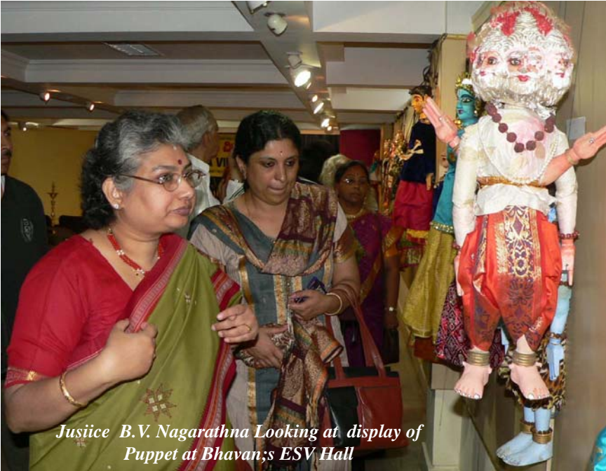
Justice B.V. Nagarathna Looking at display of Puppet at Bhavan; s ESV Hall

May 8. Justice B.V. Nagaratna said that the puppets on display were full of life and very close to reality. She noted that the