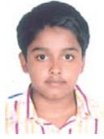
Sachin 75. 5%